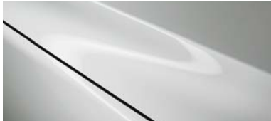
Arctic White (A4D)