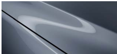
Polymetal Grey Metallic (47C)