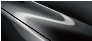
Machine Grey Metallic (46G)