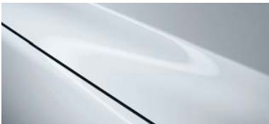
Ceramic Metallic (47A)