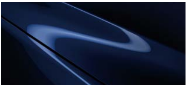
Deep Crystal Blue Mica (42M)