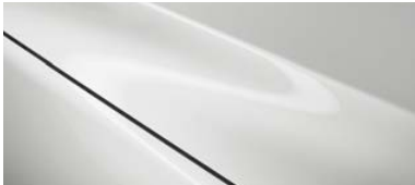
Snowflake White Pearl Mica (25D)