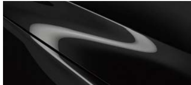
Jet Black Mica (41W)